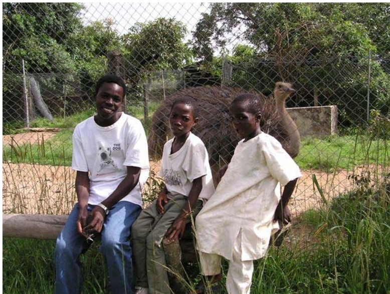
TH boys at the Wildlife Park