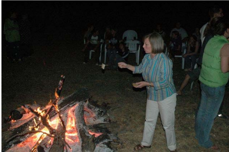
Roasting marshmallows at the SIM conference